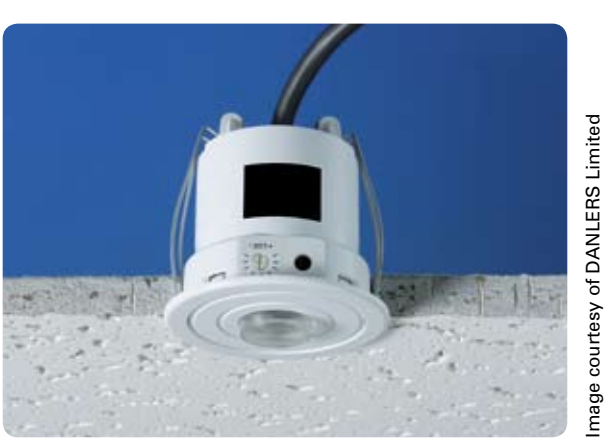
Figure 2 Ceiling flush mounted photocell switch

The five control categories may be installed either individually or in combination. There are various requirements that controls must meet in order to be eligible for ECA support. For example, controls are ineligible for support in installations where individual users can override the energy saving operation of the control. A lighting controls supplier will be able to advise on whether the installation of a particular control meets the criteria for support and can provide confirmation