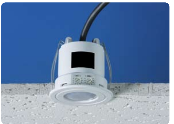
Figure 1 Ceiling flush mounted PIR Occupancy Switch with adjustable time lag function